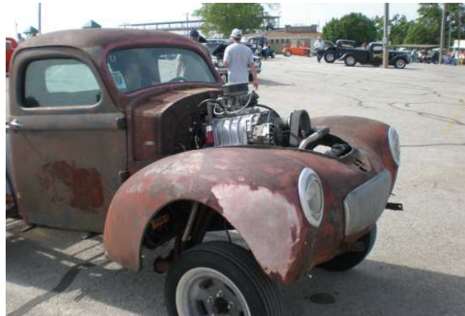
I think this is a good start for another Gasser "41 Willys pickup