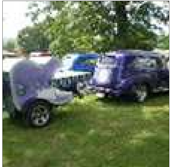
There were some unique tow trailers on hand, both for camping and hauling

The 2015 rodding season began with a trip to Springfield Missouri for the annual NSRA Mid America Nationals. We arrived in Springfield about 4 in the afternoon and got registered and then headed for the fairgrounds to check in with the NSRA safety team as this was the first event since being appointed Western South Dakota Safety Inspector. The Springfield meet is the West Central Divisions responsibility for event safety inspection coverage. I did a three hour shift and then off to check out cars and vendors. Dodging rain was an issue all weekend but it didn't stop the cruisin and overall atmosphere of the 1925 registered participants. Pouring rain moved all award activities indoors Sunday afternoon but everyone stayed till the last Three thousand dollar check was given away. Suddenly the fun was over and the long drive home began but plans are already being planned for the next journey