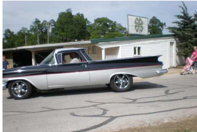
El Caminos by Chevy are very popular and this 1959 looks good