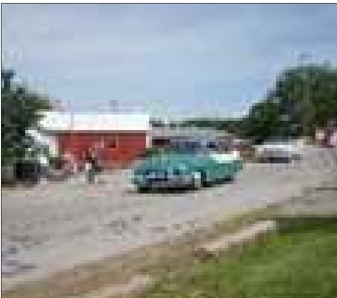
The Ozark Area fairgrounds has lots of room for cruising as well as parking to, display your car