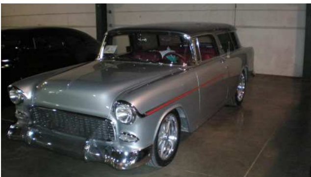
This 1955 Chevrolet Nomad wagon looks great