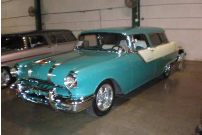
Here is a rare 1955 Pontiac Safari wagon And this one fills the bill for a classic cruiser