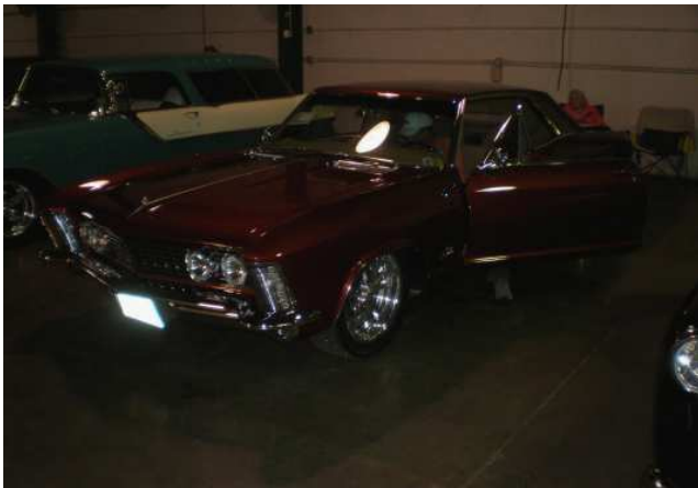
Here is a rare '65 Buick Riviera and they make neat street machines too!