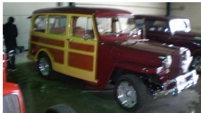
Another Willys, this one a late 40's station wagon. Maybe the next street machine!