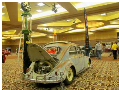
G3 Rods brought their own VW One wild '34 from WYO.