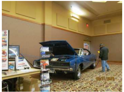
Floyd Opp shower off his magazine car A BIG WINNER