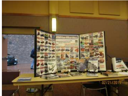
Motor Market Magazine