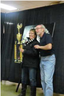
Taking home the Gold Brand's cycle won Best motorcycle and Best Overall Paint