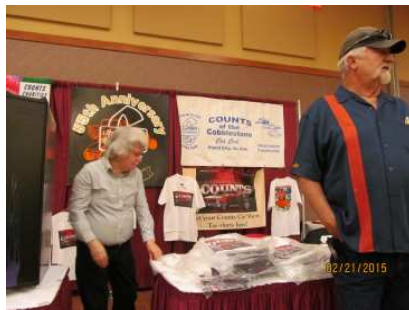
Counts T shirt sales