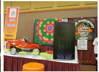
COUNTS RAFFLE ITEMS