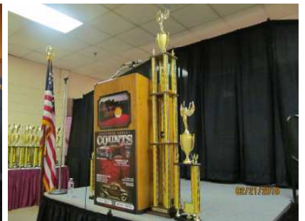
The BIG TROPHYS